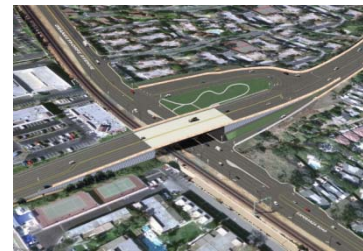
Imperial Highway Grade Separation Project